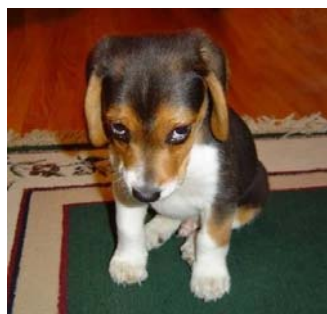
I will try to work faster next time. (the Editor)

For almost three weeks, I fought with AT&T to get my DSL installed at the new place in August. It would be scheduled and I would not have internet on that date. The they did not see an DSL order so they would resubmit the order which I would wait a week only for it still be dead. I was told I had DSL but when questioned