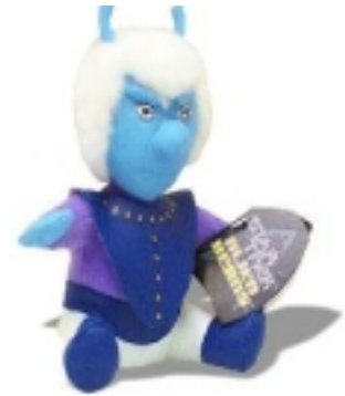
The blue-blooded Andori

enzyme diaphorase is present in human blood and constantly changes any methemoglobin back into hemoglobin before any appreciable amount accumulates in the blood stream. Diaphorase is not present in the entire Andori race. Therefore, the blood remains a very constant blue.