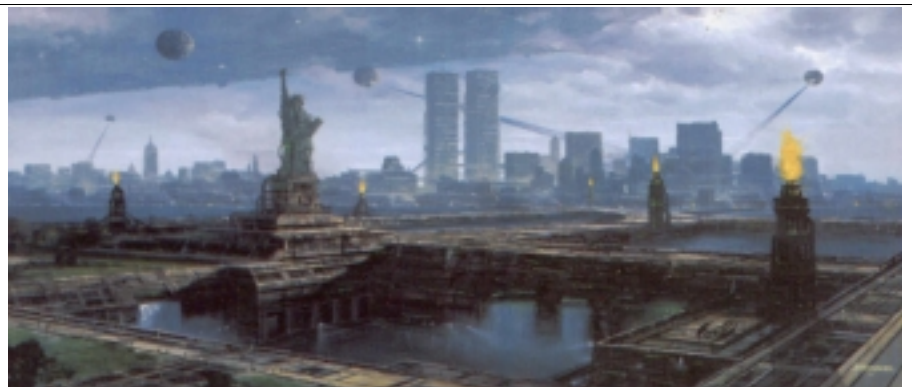
Curt of Borg’s Dreams...New Borg City